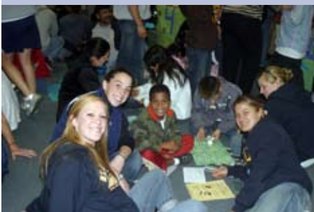
Members of the women's soccer team at the Copperfield Math Night

The St. Edward's University SAAC, along with the rest of the Heartland Conference member institutions, continues to fundraise for the Make-a-Wish Foundation. This year's fundraisers have included a student-athlete mixer and several Half-the-Pot drawings, where the winner takes home half the money raised from raffle ticket sales. SAAC has raised more than $600 for Make-a-Wish Foundation.