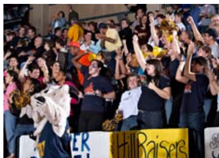
Members of the HillRaisers cheer on the basketball teams.

The next time you're rooting for the Hilltoppers, don't be alarmed if you're surrounded by a wall of students clad in identical blue shirts cheering their hearts out. They're the HillRaisers, the university's official student spirit group.