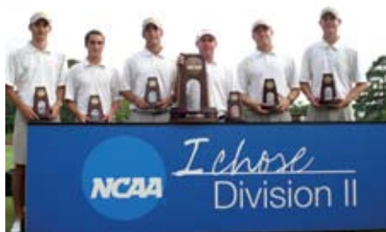
The men's golf team finished tied for second place in the nation at the NCAA national tournament in Houston.

the nation. The softball team won its first two games of the national tournament before falling twice to Emporia State University in the semifinals. The team finished the season tied for third in the nation.