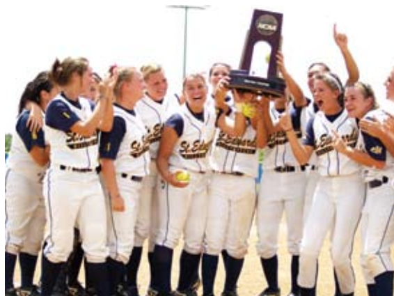
The Hilltopper softball team won its first-ever NCAA regional title and advanced to the national tournament in Houston, where the team tied for third place in the nation.

The men's golf team, whose national ranking included a one-time spot at No. 1, played a solid tournament and rallied on the final day to finish regulation tied for first. The team lost in a three-way sudden-death playoff but ended the season tied for second in