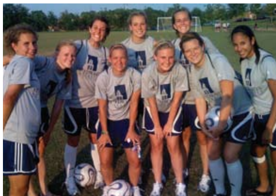
Women's soccer team

The Hilltopper women's soccer team, fresh off its second-consecutive Heartland Conference title, will take 34 student-athletes to Campinas, Brazil, in August. The two-week trip will serve as a training camp, where the team will complete pre-season workouts and hold scrimmages with Brazilian teams.