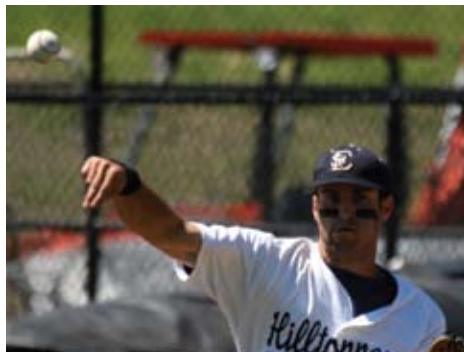
The Hilltopper baseball team won its second-straight Heartland Conference title along with posting 40-plus wins for the second-straight year.

One hundred thirty St. Edward's University student-athletes received Heartland Conference academic awards during the 2007–2008 academic year. The overall GPA of student-athletes for 2007–2008 was 3.2, the second highest in the conference. Three teams — baseball, men's basketball and women's tennis — compiled the highest GPA in their respective sports.