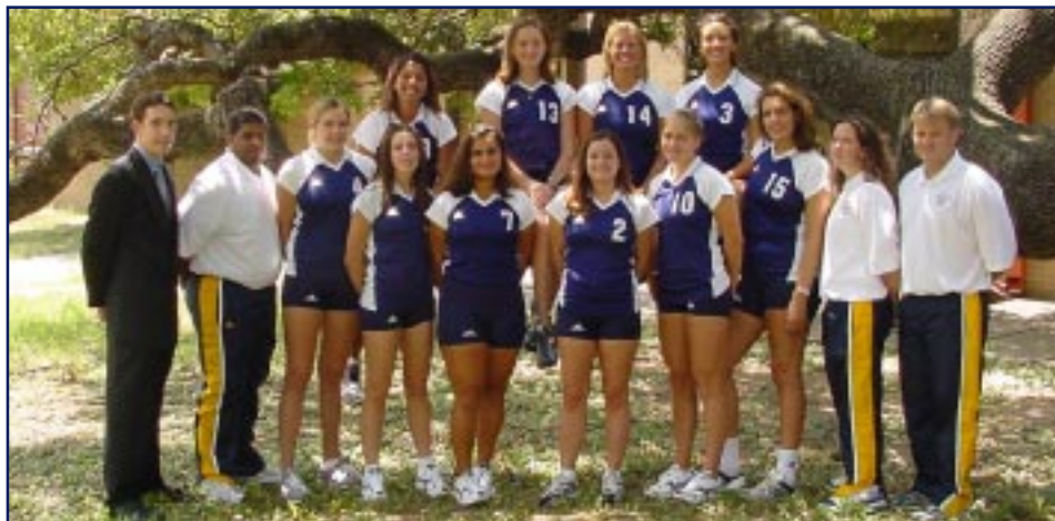
The 2003-04 St. Edward's University volleyball team earned a grade point average of 3.47 as a team. Six players on the team gained a 3.50 GPA or better including one 4.0 GPA.