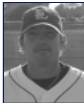
Josh Hamilton Baseball