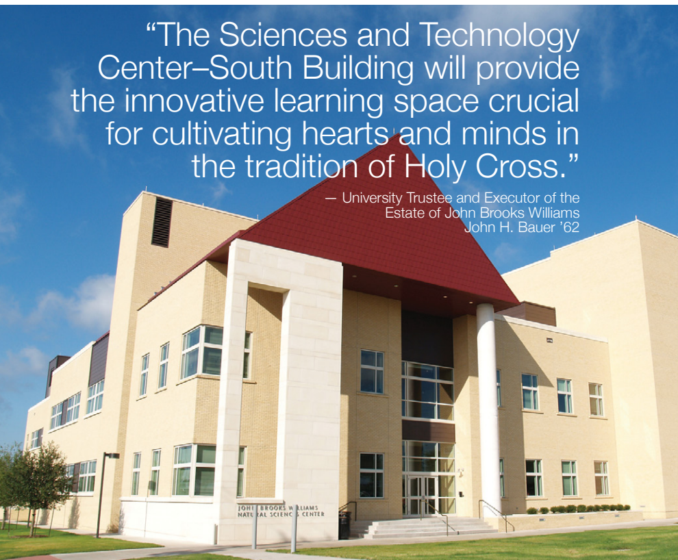
The John Brooks Williams Natural Sciences Center—North Building opened its doors to students in Fall 2006.