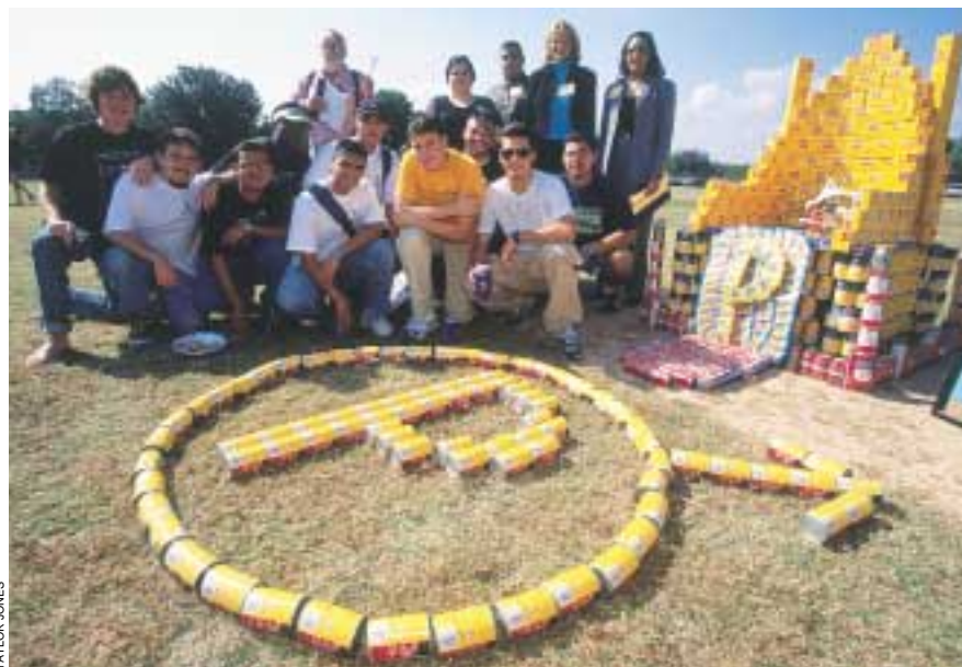
Students got to play with their food as part of the groundbreaking for a new residence hall. Above, the men of Premont Hall pose with celebrity judges.

The groundbreaking event marked the beginning of the $7.5 million residence hall, which will house 180 students when it opens in time for spring semester 2003.