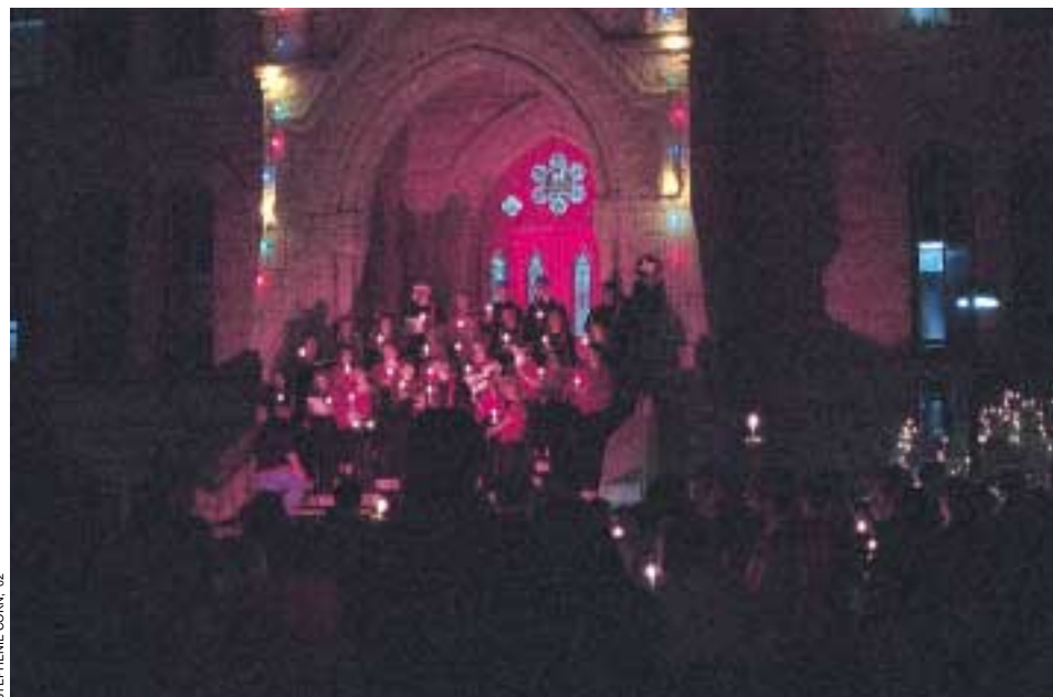
The campus community celebrated the season with the 23rd Annual Festival of Lights.