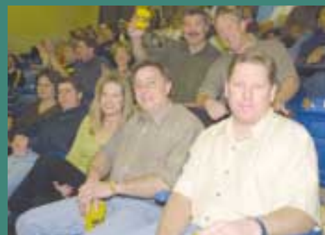
St. Edward's University alumni joined students, faculty and staff in cheering on the Hilltoppers during the Homecoming game against the St. Mary's Rattlers.