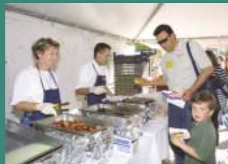
St. Edward's University alumni participated in a tailgate picnic on Saturday, February 23, one of the many events during Homecoming week.