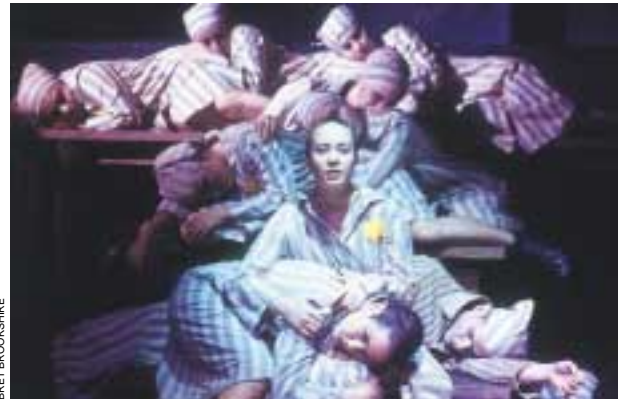
Arthur Miller's Playing for Time featured powerful performances by students and guest artists.