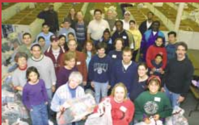
In December, St. Edward's University alumni from Austin, Dallas, Houston and San Antonio prepared Christmas gifts for distribution as part of the Christmas Alumni Service Event Program. The Salvation Army Angel Tree project helped spread Christmas cheer and Hilltopper pride throughout the communities.